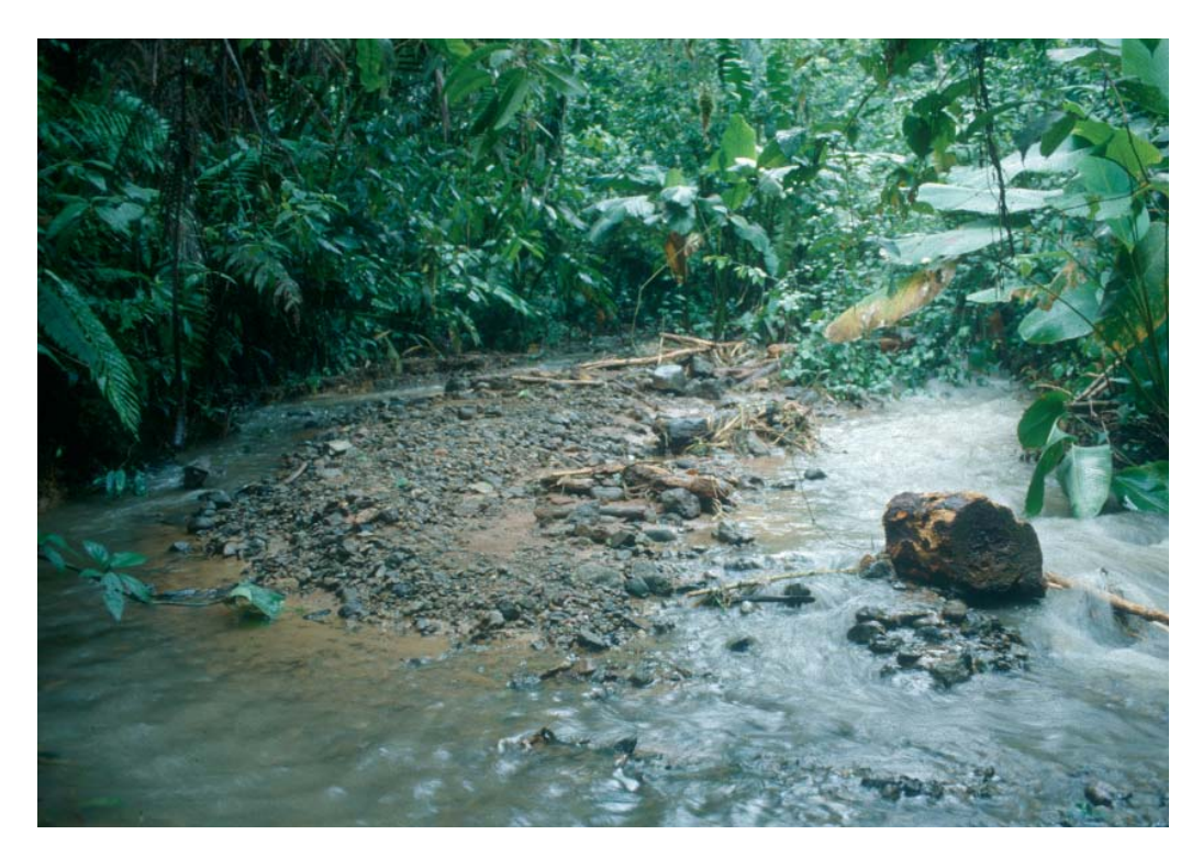
Fig. 7: Type locality of R. sehnali sp.n.: Quebrada Negra, Esquinas National Park.

thickened. Base of middle femur of female not flattened. Hind tibia apically without crescent-shaped spur. Proctiger of male basally with well developed lateral lobes. Paramere of male distally not curved dorsad. – However, by its general appearance, the structures of hind legs and male genitalia, and the strong modifications of the abdomen of the female, the new species is only distantly related to the other species of the group. Most importantly, though they are present, the new species does not show well the two proposed synapomorphies of the group (POLHEMUS 1997), i.e. the shape of the proctiger and the dentation on the hind tibia. The lateral lobes of the distal cone of the proctiger are relatively poorly developed, and there is no "conical spike" (POLHEMUS 1997) on the hind tibia of the male. The latter character is also absent in some other species of the group and might be an effect of the small size of R. sehnali sp.n.